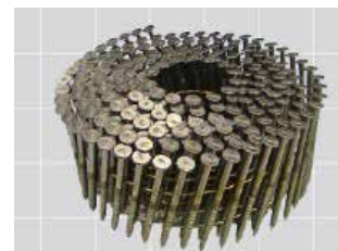
15° wire coil collation